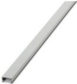
Cover for cable duct, light gray, halogen-free, width: 30 mm, length: 2000 mm

Please be informed that the data shown in this PDF Document is generated from our Online Catalog. Please find the complete data in the user's documentation. Our General Terms of Use for Downloads are valid ( http://phoenixcontact.com/download )